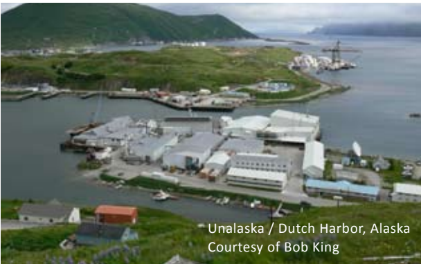
Unalaska / Dutch Harbor, Alaska

Alaska leads the nation in production of seafood with an annual harvest that was 52% of all seafood landed in the United States in 2009. Unalaska/Dutch Harbor has reigned as the nation’s top fishing port in terms of volume for decades and it also ranks as the second top port in terms of ex-vessel value, the price paid fishermen for their catch.