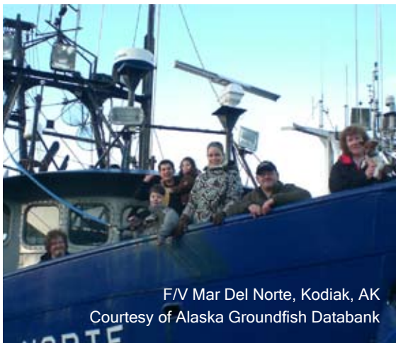
F/V Mar Del Norte, Kodiak, AK

Alaska's seafood – salmon, crab, pollock, halibut, cod and more – is one of the largest renewable resources in the world. Alaska's seafood production ranks 14th in the world and leads the nation's harvest from the sea. Raised wild and harvested sustainably, Alaska's quality seafood graces the finest white-tablecloth restaurants and satisfies appetites on the go at the corner fast-food outlet.